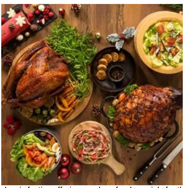
Rise offers a spread of classic festive offerings and seafood specials for the year-end celebrations

From 10 to 25 December, savour a spread of festive favourites at Rise at Marina Bay Sands, as the restaurant presents an array of cold plates, festive selections, and sweet treats. Gather your loved ones and indulge in a luxurious Christmas dinner featuring Roasted Australia Wagyu Hip with Onion Gravy & Yorkshire Pudding and Traditional Roasted Turkey with Stuffing and Giblets Sauce , alongside unlimited servings of fresh Whole Tuna, Hamachi, Lobster & Alaskan King Crab. Live stations will serve Pan Seared Hokkaido Scallop with Braised Leek & Potato & Black Truffle Shaving and Pan Seared Foie Gras with White Peach, Brioche & Balsamico Reduction.