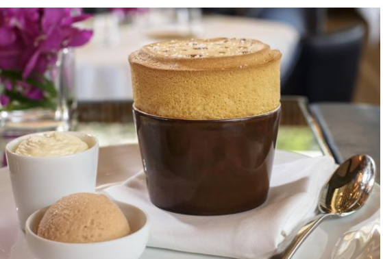
Savour the best of Spago's award-winning cuisine (from L to R): Grilled Colorado Lamb Chops and Salted Caramel Soufflé

Celebrity chef restaurant Spago by Wolfgang Puck presents a four-course Christmas Eve menu (S$195++), featuring its signature Kaya Toast , a reinvention of the Singapore classic local breakfast, alongside dishes such as USDA Prime Côte de Boeuf for Two with a side of Aligot Potatoes , Roasted Bone marrow and Black Truffles , and Colorado Lamb "Ribeye" with Caramelized Heirloom Carrots , Eggplant Caviar , Tzatziki , Marcona Almonds and Parmesan Polenta . Dessert lovers will delight in Spago's signature Salted Caramel Soufflé with Farmer's Market Fuji Apple Sorbet .