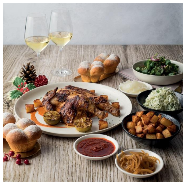
Adrift offers two sharing platters (from L to R): the Grand Plateau Seafood Platter and the Smoked Peri Peri Chicken Platter , perfect for a group gathering

Adrift by David Myers presents an exquisite feast this holiday season. Dive into a hearty seafood spread and indulge in the Grand Plateau Seafood Platter (S$128++), featuring fresh seafood such as Alaskan King Crab Leg, Hokkaido Sea Urchin, Big Eye Tuna, French Mussels and langoustine. Elevate the experience with an additional topping of caviar (from S$98++ for 30 grams) or pop a bottle of champagne (from S$180 per bottle). Guests can also spice up the holiday season with Smoked Peri Peri Chicken Platter (S$88++), a sizzling feast featuring a wood-fired Peri Peri Chicken and an array of sides such as Sherry Vinegar Watercress Salad, Shredded Mustard Leaf Cabbage Salad and Peri Peri Spiced Potato Frits. Brined in spice and citrus, this whole bird is smoked and barbequed to perfection before it is glazed in a special hot sauce. The platters are available for the whole month of December.