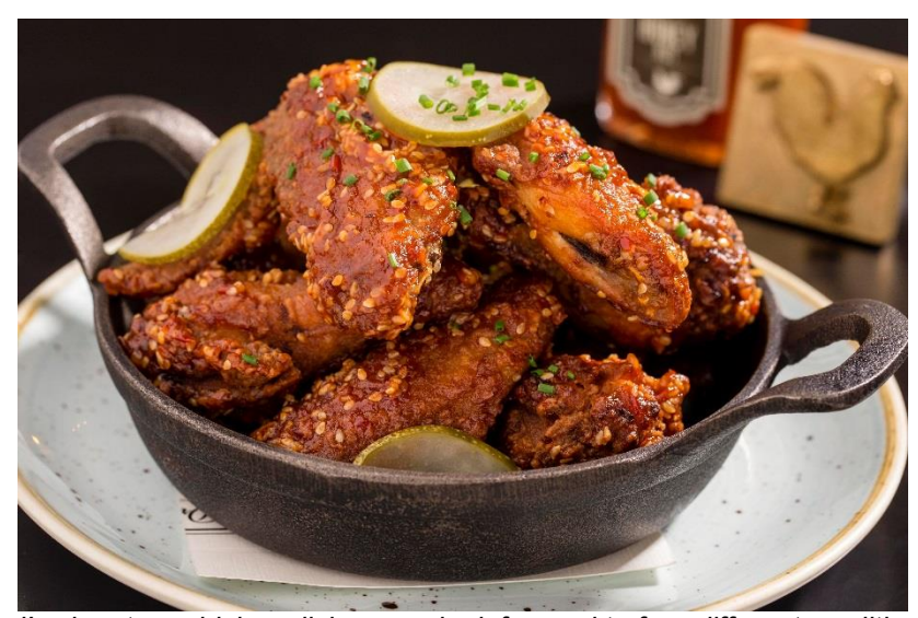
Fans of The Bird's signature chicken dishes can look forward to four different renditions in November, such as the Nashville Hot Chicken

The Bird Southern Table and Bar celebrates Southern Fried Chicken Month in November with four different styles of its signature fried chook. From 1 to 11 November, savour the succulent juicy Carolina BBQ chicken , coated in a sweet and tangy Carolina mustard BBQ sauce. From 12 to 18 November, the traditional Louisiana Cajun Style chicken takes the centerstage, as the restaurant offers a version of buttermilk and hot sauce marinated chicken, dusted with Cajun spices and fried to a golden crisp. Diners can also try the Nashville Hot Chicken (19 – 25 Nov), tossed in fiery hot Nashville sauce and served with cooling house pickles or the smoked Hickory BBQ chicken (26–30 Nov). Each dish is priced at S$24++.