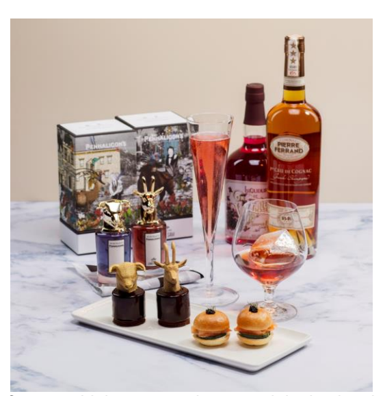
Experience a bespoke afternoon high tea experience and tipples inspired by Penhaligon's new fragrances at Renku

From 5 November to 9 December, Marina Bay Sands' premium lounge Renku will be offering handcrafted cocktails inspired by luxury British perfume house Penhaligon's new line of fragrances. Sip on The Blazing Mister Sam (S$20++) – a heady concoction of cognac, absinthe, bitters and crème de cassis, or delight in the nectarous Changing Constance (S$20++) – a bubbly concoction of champagne, vodka, raspberry liqueur, crème de violette and cranberry juice. Renku's bespoke afternoon high tea experience (S$48++; two seatings at 2pm and 4pm) will also feature Penhaligon-inspired pastries and desserts, and all high tea guests will enjoy complimentary fragrance samples and limited-edition scented silk handkerchiefs in the iconic Kristjana Williams design.