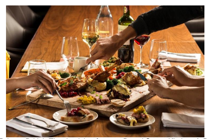
Enjoy a British Thanksgiving feast at Bread Street Kitchen & Bar

This Thanksgiving, relish in a decadent medley of dishes at Bread Street Kitchen with its three-course Thanksgiving menu (S$79++ per person). Begin the hearty spread with a starter of Brie stuffed Portobello mushrooms with walnut pesto and berry compote , before savouring a platter of Traditional roasted turkey and beef striploin, with pigs in blanket, a side of Yorkshire pudding, roasted potatoes, brussels sprouts, glazed carrots, cranberry and gravy. End the feast with a luscious Pumpkin and pecan nuts pie with clotted cream . The Thanksgiving menu is available from 22 to 25 November for both lunch and dinner service, and will be served as sharing plates (minimum 2 persons).