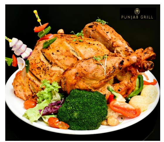
Spice up your family feasts with Punjab Grill's Tandoori Turkey

complimentary admission to Digital Light Canvas . For more information, please visit https://www.marinabaysands.com/entertainment/digital-light-canvas.html.