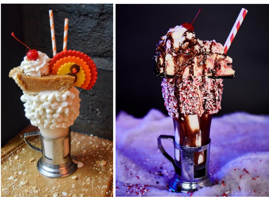
Celebrate the festive season with a visual feast (from L to R): Thanksgiving Shake and Holiday Shake

Indulge in gratifying sweet treats at Black Tap Craft Burgers and Beer as the restaurant rolls out two festive-themed CrazyShakes for the year-end celebrations. Exclusively available from 19 to 22 November, the pumpkin-based Thanksgiving Shake (S$22++) features a vanilla frosted rim with mini marshmallows, and is topped with a slice of creamy pumpkin pie, a turkey marzipan lollipop, swirls of whipped cream, and a Maraschino cherry.