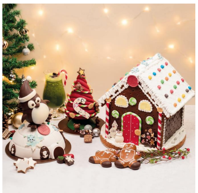
SweetSpot's whimsical sweet treats makes the perfect centrepiece for all home parties

Pick from a selection of cakes, pralines and cookies at SweetSpot this festive season, available from 5 November to 31 December. The SweetSpot Signature Christmas Tree ($$70) — an assembly of chocolate-covered candied almonds, toasted coconut flakes, Christmas chocolate ornaments and sugar rocks - is a perfect centrepiece for any Christmas gatherings. Guests can take their pick from an array of luscious cakes, which include the rich Dark Chocolate Hazelnut Praline and Chestnut Log cake ($68) and the classic Christmas Gingerbread House ($$60). This year, SweetSpot will also be offering customisable gift hampers, which include items such as a bottle of Champagne Piper Heidsieck, Chef's special Stollen, a box of SweetSpot Macarons and pralines, a special Christmas cookie tin and an exclusive tea jar from Renku.