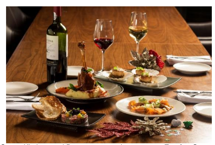
Bread Street Kitchen and Bar presents a three-course Festive Season Menu

This Thanksgiving, relish in a decadent medley of dishes at Bread Street Kitchen with its three-course Thanksgiving menu (S$79++ per person). Begin the hearty spread with a starter of Brie stuffed Portobello mushrooms with walnut pesto and berry compote , before savouring a platter of Traditional roasted turkey and beef striploin, with pigs in blanket, a side of Yorkshire pudding, roasted potatoes, brussels sprouts, glazed carrots, cranberry and gravy. End the feast with a luscious Pumpkin and pecan nuts pie with clotted cream . The Thanksgiving menu is available from 22 to 25 November for both lunch and dinner service, and will be served as sharing plates (minimum 2 persons).