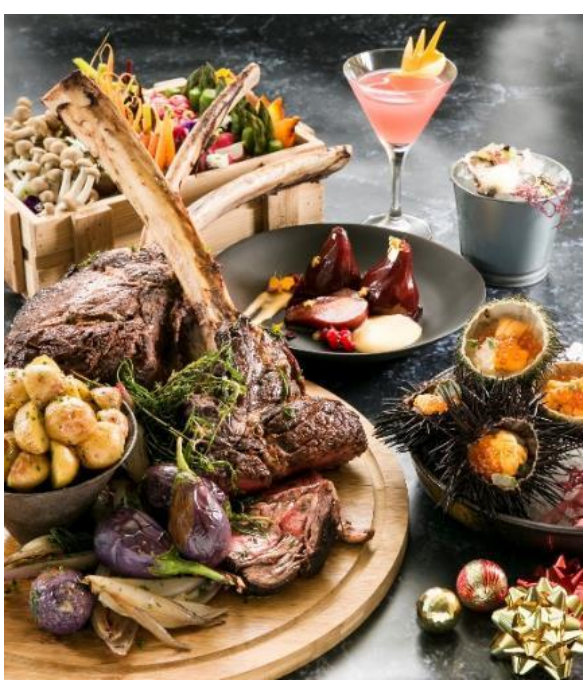
Indulge in a festive feast amidst a spectacular view of Singapore's city skyline at Club55

On Christmas Eve (8.30pm till late), Club55 at Marina Bay Sands presents a luxurious Christmas Eve Buffet ($$180++ for adults, $$78++ for children), featuring an extensive selection of fine food and wines from cold plates and charcuterie to festive mains, live