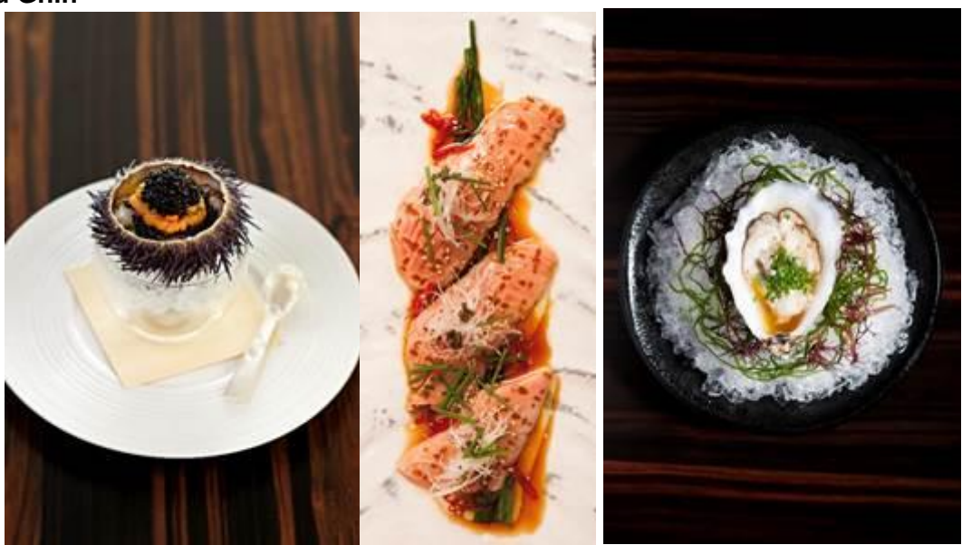
Savour the best of Waku Ghin this festive season (from L to R): Marinated Botan Shrimp with Sea Urchin and Caviar; Aburi Tasmanian Ocean Trout with a Hint of Chili, and French Gillardeau Oysters with Ginger and Rice Vinaigrette

On 24 and 25 December, two-Michelin-starred Waku Ghin presents a 10-course Christmas Tasting menu (S$550++), featuring the finest seasonal ingredients and produce. Enjoy the restaurant's signature Marinated Botan Shrimp with Sea Urchin and Oscietra Caviar , alongside premium dishes such as the Warm Salad of Tasmanian Cape Grim Tenderloin with Truffle, Slow-Cooked Kinmedai with Risotto, Gobo and Truffle, and Seared Canadian Lobster with Fennel and Bouillabaisse . Complete the experience with a sweet dessert of Chocolate Fondant with Cherry and Vanilla and petit fours.