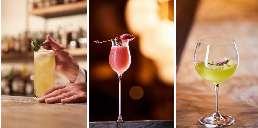
Gear up for the night race with WAKUDA's artisanal Japanese cocktails (from L to R): Okinawa no Mori; Lady from Shizuoka; Stone, Water, Plants

During the F1 weekend, head to the vibrant WAKUDA bar for a pre-race drink and indulge in a selection of Japanese-style handcrafted cocktails. A WAKUDA-style twist on the classic Tom Collins, the refreshing Stone, Water, Plants (S$25++) presents a well-balanced combination of Roku Gin, cucumber shiso, green tea and cucumber tonic, with its name inspired by the imagery of a lush symphony of nature. For a more playful tippie, the Lady from Shizuoka charms with its rousing mix of Roku Gin, strawberry sake and sakura liqueur, topped with a frozen strawberry lollipop.