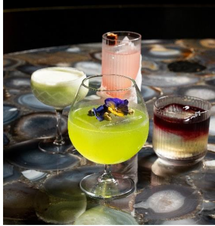
Cheers to an exhilarating race season with innovative cocktails from Mott 32 (clockwise from top left): Racing Lawn; 8 Treasure Trophy; Red Light; Jade Forest

Over at contemporary Chinese restaurant Mott 32 , race fans can look forward to four F1-exclusive Asian inspired tipples available from 26 September to 2 October. Headlining the series is the sultry Red Light (S$28++), a robust bourbon-based concoction of yuzu juice, lemon juice and aged rum demerara, topped with a mesmerising layer of Shanxi Marselan red wine. Fuel up with the luminescent neon green Jade Forest (S$26++), featuring a mix of melon-flavoured Midori, gin, oleo saccharum, sudachi and soda. Filled with botanical notes, the cocktail is a balanced blend of juicy melon with a variety of citrus, including the homemade oleo saccharum (a sugar-oil mixture produced by coating citrus fruit rinds in sugar), offering an elevated sustainable drinking experience.