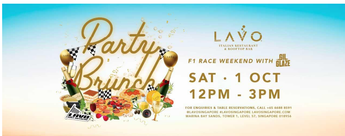
LAVO Italian Restaurant & Rooftop Bar will roll out a special F1-edition of its famed Party Brunch series on 1 October

For a truly indulgent treat, savour the sublime N25 Schrenckii caviar (S$688++ for a 125g tin) harvested from the rare Schrenckii sturgeon. Prized for its lingering nutty and buttery flavours with creamy egg yolk nuances and subtle hints of floral notes, this is the caviar that dreams are made of. Round off the meal with the nectarous musk melon (S$90++ for a quarter cut). For reservations or enquiries, please email koma.reservations@marinabaysands.com or call 6688 8690.