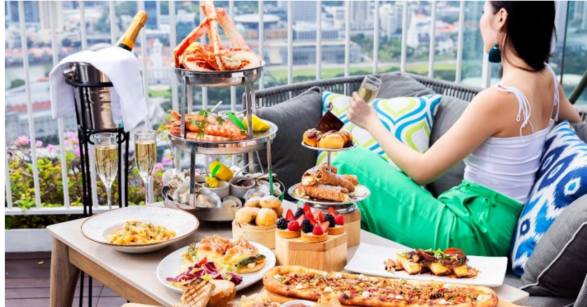
Look forward to a magnificent Sunday Champagne Brunch at LAVO Singapore on 2 October

Tickets for LAVO Party Brunch: F1 Race Weekend with Gil Glaze are available online at LAVO Singapore's website . Early bird tickets are priced at S$168++ per person, first release tickets are priced at S$198++ per person, and second release tickets are priced at S$248++ per person. Limited tickets will also be available at the door (unless sold out).