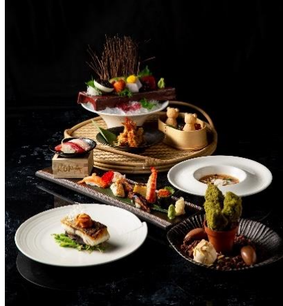
A luxurious feast awaits at KOMA Singapore over the F1 weekend

Rev up for the F1 weekend at KOMA Singapore , as the contemporary Japanese restaurant presents an extraordinary line-up of seven dishes harnessing the freshest and finest produce from the land and sea, available for dinner from 30 September to 2 October.