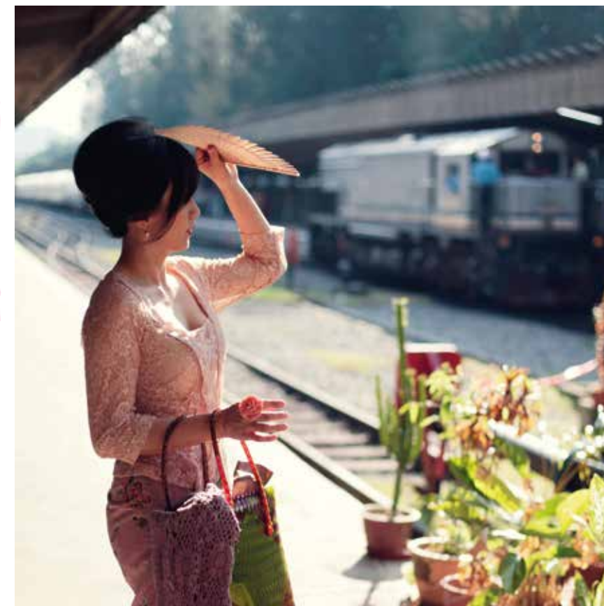
'En Passant' by Adeline Kueh

Find the photograph 'En Passant' in the exhibition; take a few minutes to study the image and consider these questions on your own: